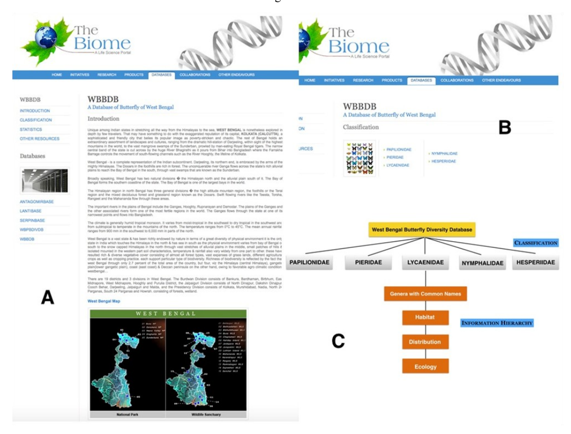
Figure 1. West Bengal Butterfly Biodiversity Database (WBBDB). A: Home Page of the database, B: Classification Scheme of the members; C: Overall Database Architecture.